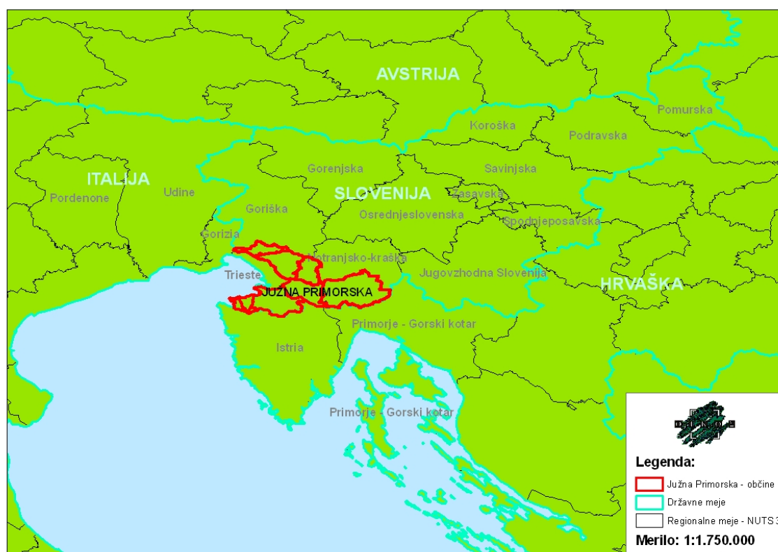
Figure 2: South Primorska and the neighbouring regions

The main natural characteristics of the region are the alternation of flysch and limestone landscapes, sub-Mediterranean climate and, in particular, its maritime position, which allowed for the development of tourism and transport. Namely, it is the only Slovenian region lying by the sea and with its 46 km of coast, it represents a certain “window to the world”. Closely built villages are a typical settlement pattern. During the last decades, littoralization – a process of concentration of the population and economic activities on the coastal strip – is becoming an increasingly distinctive trend. The region may be divided into three parts: the coastal part or Slovenian Istra, Kras and Brkini. These areas differ from each other in their natural, social and environmental features, which will be pointed out where necessary hereafter.